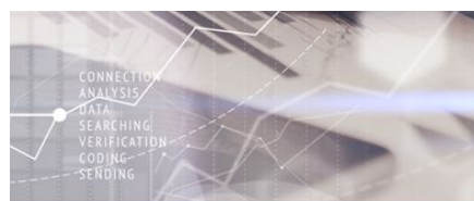
UNIT FOUR Launching Data Services