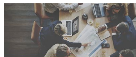
UNIT FIVE Project Management and Assessment