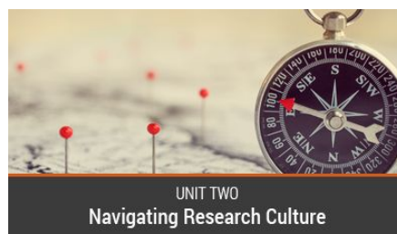
UNIT TWO Navigating Research Culture