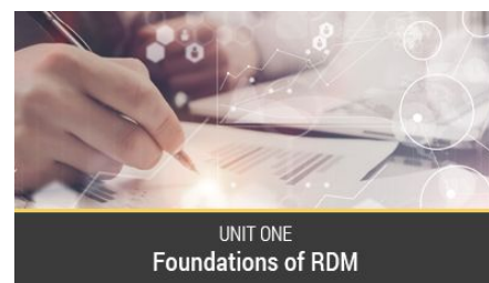
UNIT ONE Foundations of RDM