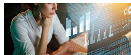
UNIT SEVEN Coding Tools