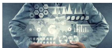
UNIT SIX Data Analysis and Visualization Tools