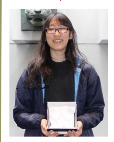
Grace Im Health Science Library